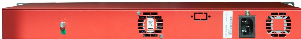
Figure 1-2 1U chassis rear layout

The rear of the chassis provides access to the following interfaces and information: