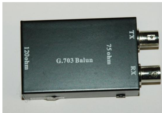
Figure 1-5 75 Ohm E1 Balun

Each 75 Ohm trunk is normally connected via a pair of coaxial cables with BNC connectors. A Balun is available to convert between RJ45 and co-axial cabling. The Balun also converts between 120 and 75 Ohm interfaces, so the system does not need to be configured for 75 Ohm operation when this type of converter is used.